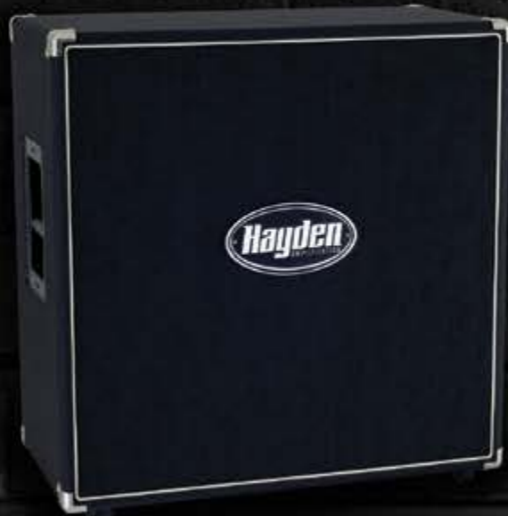
MoFo 212 flat