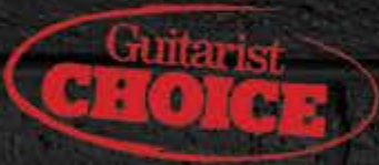
Classic Compact 412