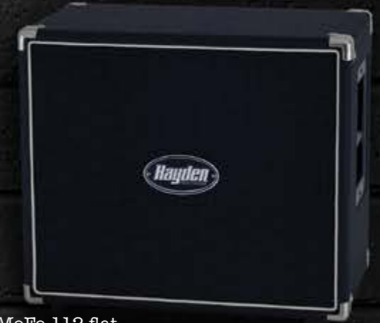
MoFo 112 flat