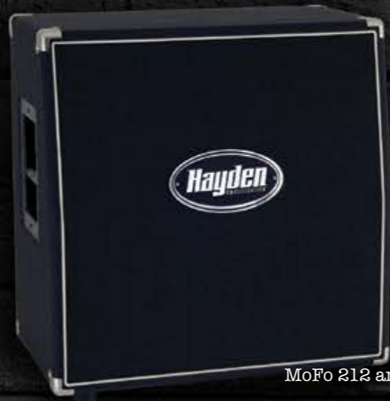
MoFo 212 angled