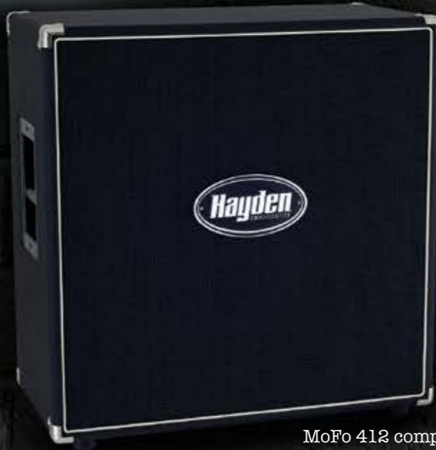
MoFo 412 compact

The new compact cabs achieve these goals. Constructed from quality 15mm ply, the cabs contain Hayden custom designed drivers delivering whatever is thrown at them with authority, despite their small stature. The compact range consists of 1x12 Angled, 1x12 Flat, 2x12 Angled, 2x12 Flat and 4x12 Flat cabinets. Designed to perfectly compliment the Lil' MoFo head, there is also, for the first time, a Hayden 1x8 cabinet.