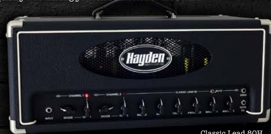
Classic Lead 80H