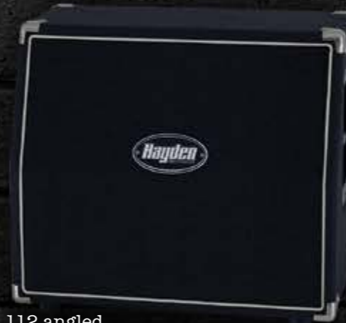
MoFo 112 angled